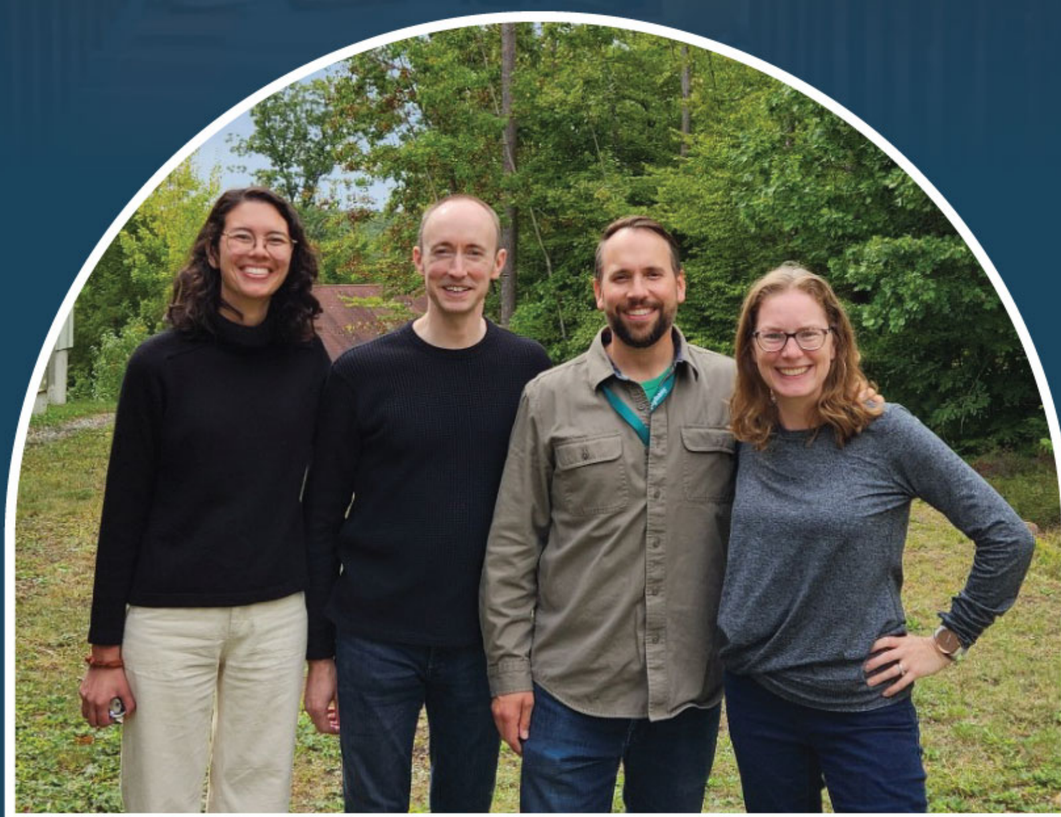
Not pictured: our finance, facilities, and administrative staff members